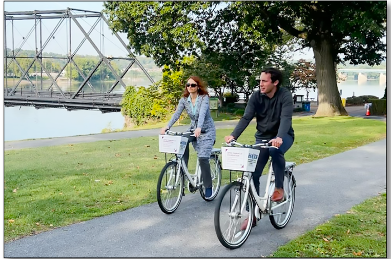
Two of our happy SusqueCycle riders enjoying Harrisburg's Riverfront Park